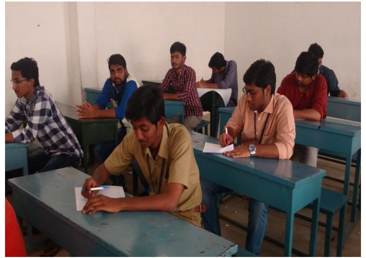
The NSS volunteers who were participated and stood as winners in the district level youth festival competition held at Vaagdevi Institute Of Technology & Sciences in Proddatur on 06/01/2018.